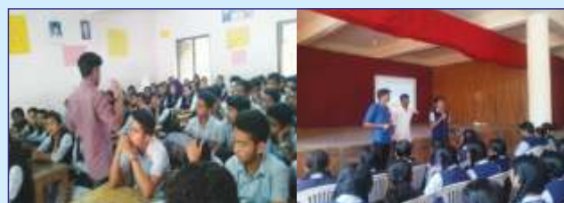
at Govt. VHSS, Nedumkandam